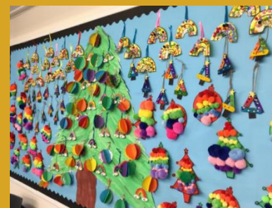
Above (L to R): Children showing off their jumpers on Christmas jumper day at Brent Knoll and East Brent, a lovely festive display at Weare