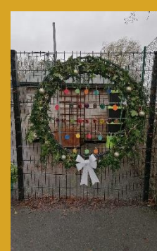
Above (L to R): Children enjoying Christmas lunch at East Brent and Axbridge, Kings students with letters for care home residents, a lovely wreath at Lympsham