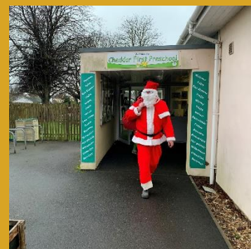
Above (L to R): Christmas lunches at Weare, children preparing for their nativity at Mark, and Santa visiting the children at Cheddar!