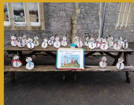
Above (L to R): Brent Knoll children dressed for their nativity, a beautiful real donkey at Weare, a little addition to Fairlands' sign, and snowmen at Lympsham