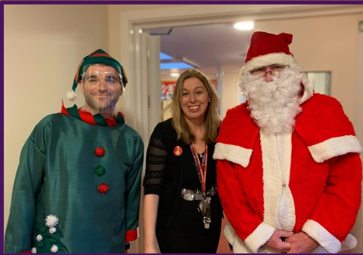
Left: A special visitor at Cheddar First School on the last day of Term

We hope you enjoy this edition of the newsletter, and before you read on we'd also take this time to wish you and your family all a Merry Christmas and a happy and safe new year from everyone at the Trust! Let's hope 2021 will be a good one.